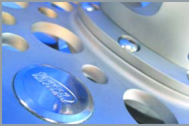
FURLING & REEFING SYSTEMS